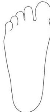
BOTTOM OF FOOT