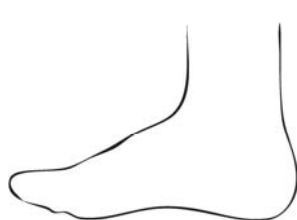
OUTSIDE OF FOOT