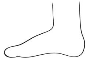
INSIDE OF FOOT