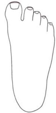
TOP OF FOOT