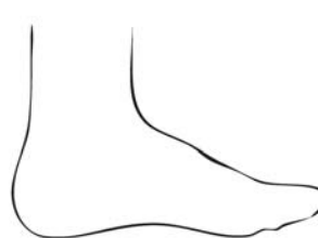
OUTSIDE OF FOOT